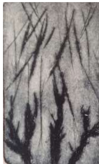
Kim McDonald - Tree - 7cm x 4cm