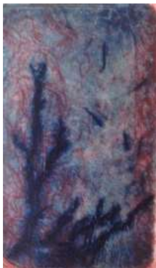
Kim McDonald - Sky - 7cm x 4cm

GECKO STUDIO GALLERY 15 FALLS RD FISH CREEK PH 03 5683 2481 GECKOSTUDIOGALLERY.COM.AU